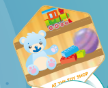
AT THE TOY SHOP

Action-based learning helps children assimilate the language. EMYS' learning sets bring the physical world to the digital dimension. Each set is composed of colourful, tangible, and theme-based smart toys and smart tags that stimulate kids' senses for in-depth learning.