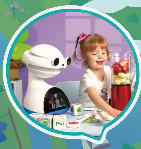
Put language in context