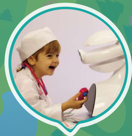
Take care of EMYS