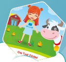
ON THE FARM