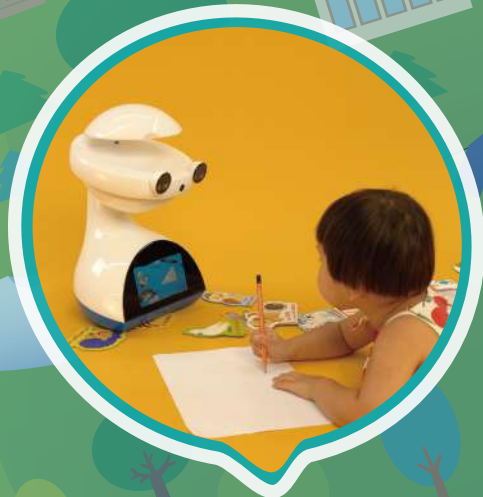
Create & Learn