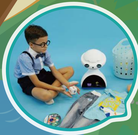
Playfully activate new skills