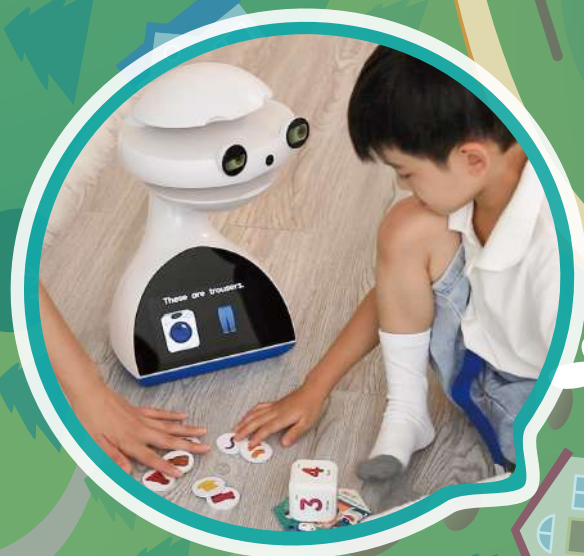
Speak in phrases