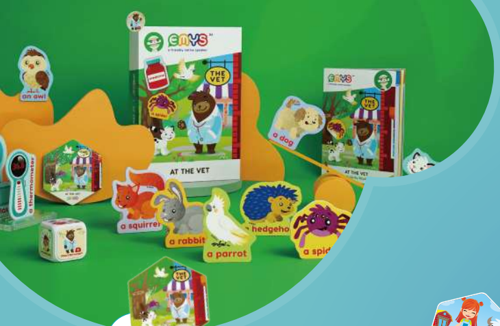
AT THE VET