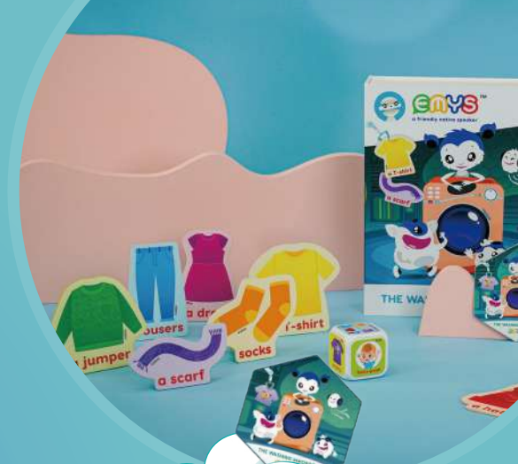
THE WASHING MACHINE