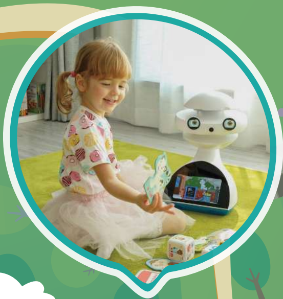
Learn new words