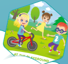
AT THE PLAYGROUND