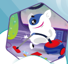
THE VACUUM CLEANER